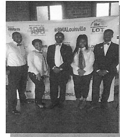
2017 Local Case Competition Participants

If you know anyone that could benefit from this program, please invite and encourage them to email us at kynbmbaa@gmail.com .